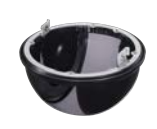
WV-QDC508G Dome Cover