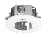
WV-QEM505-W Ceiling Mount Bracket