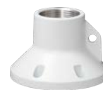
WV-QCL101-W Mount Bracket