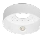
WV-QIB505-W Base Bracket