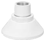
WV-QSR506F-W Mount Bracket