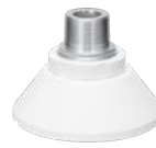
WV-QSR506M1-W Mount Bracket