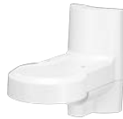
WV-QWL502-W Mount Bracket