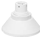
WV-QSR506-W Mount Bracket