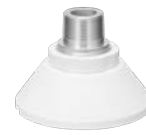
WV-QSR506M-W Mount Bracket